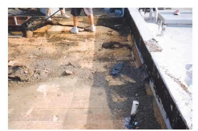
In the process of repairing the roof.

Would it need to be torn off or could a new roof be installed on top of the old roof? What about the removal of the debris of the old roof? Would the work impact her neighbor's roofs? Was a permit required from the D.C. government? Would the air conditioning and heating units on top of the roof be impacted by the roofing work? Was it time to replace the old skylight and hatch at the same time? What about the gutters and down spouts?