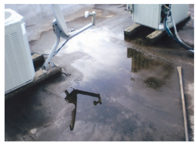
Condition of roof before work began.

What type of roof did she currently have? Would the new roof have to be made of the same materials? Was the roof in multiple layers (an older roof with a newer roof on top)?